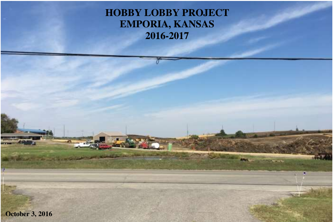
October 3, 2016