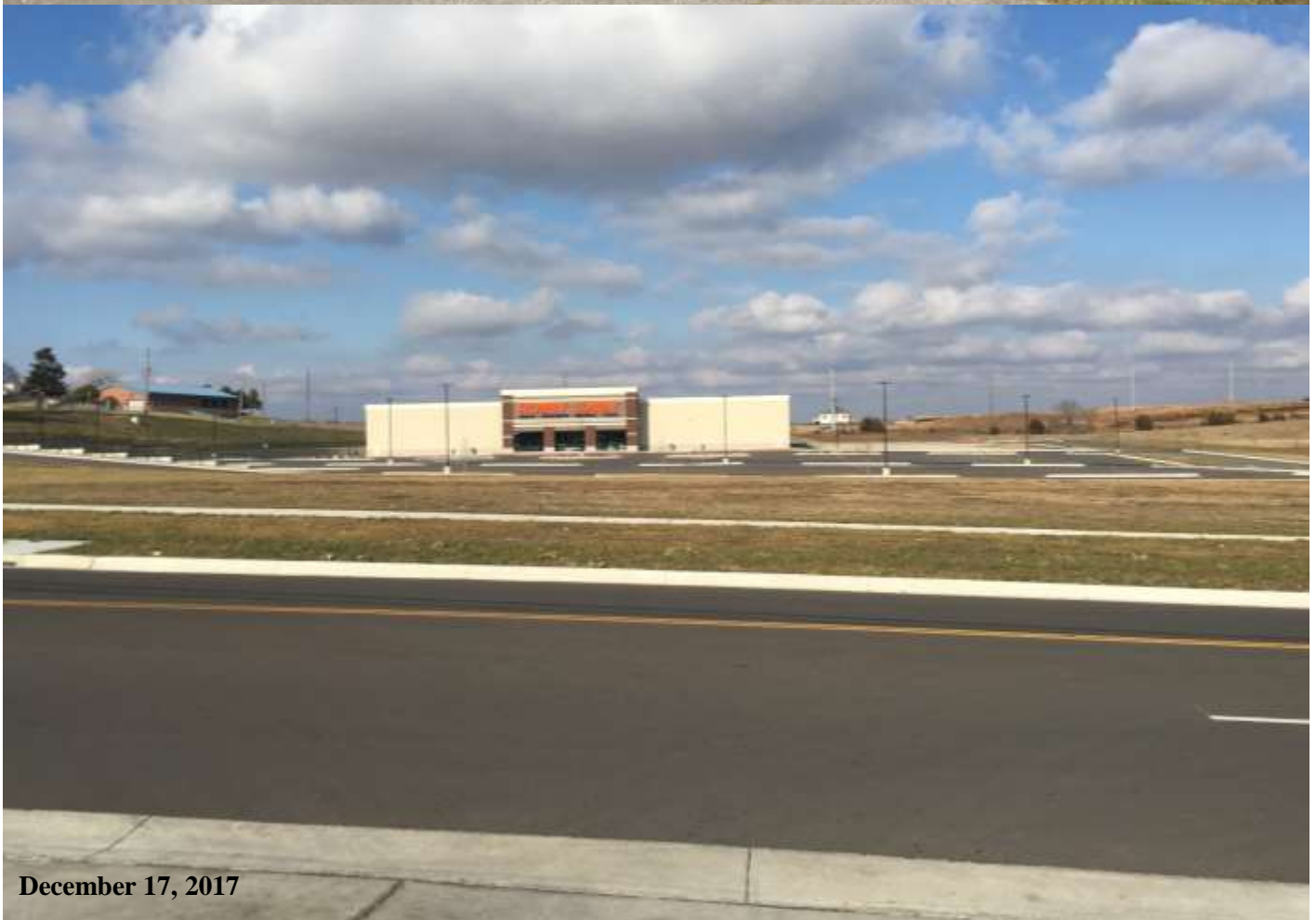
December 17, 2017